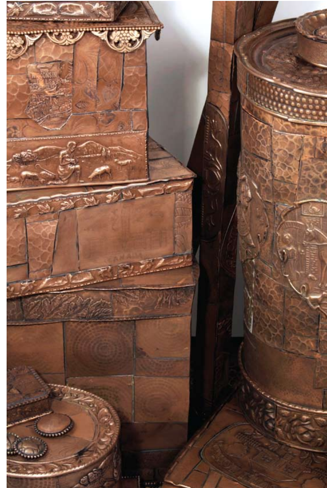
Commemoration of Occasion fragments of metalwares cast in plastic, 42x 38x 36 in., 2010