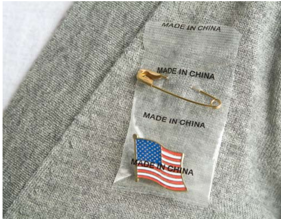
Dollar General , digital print, 24x 36 in. 2008