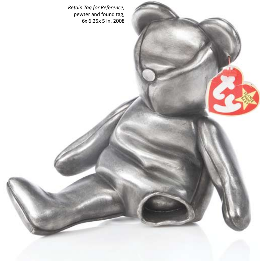
Retain Tag for Reference, pewter and found tag, 6x 6.25x 5 in. 2008